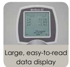
Large, easy-to-read data display