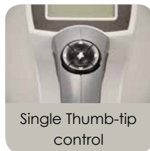
Single Thumb-tip control